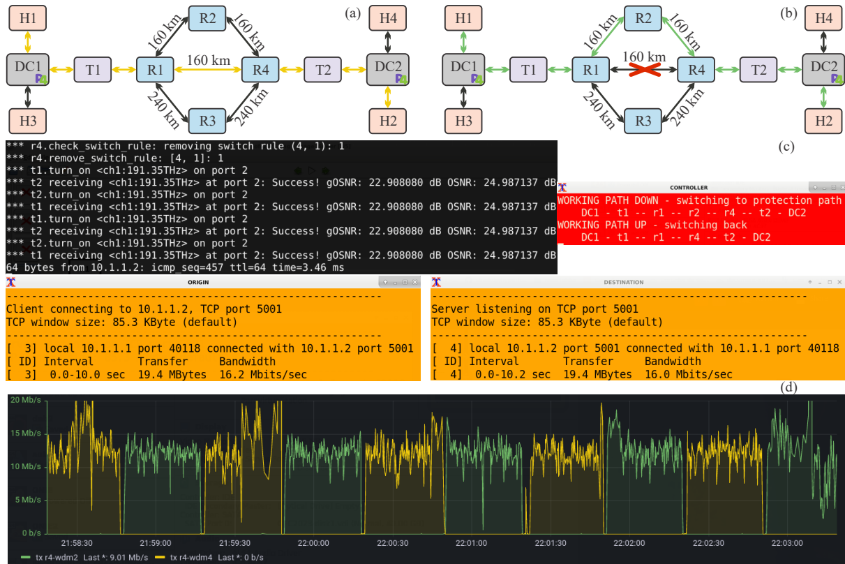
Fig. 2. Experimental setup for packet-optical IBN with survivability intents. (a) Network Layer emulated in Mininet-Optical comprising two P4 switches (DC1 and DC2) with two hosts each (H1, H2, H3 and H4), four ROADMs (R1, R2, R3, and R4), and two transponders (T1 and T2). (b) Protection switching in case of a failure in the R1-R4 link. (c) Command line captions indicating: a fast-response local agent/controller (red); Mininet-Optical CLI (black); traffic generator - producer/consumer (orange). (d) Real-time working and backup path throughput upon protection switching.